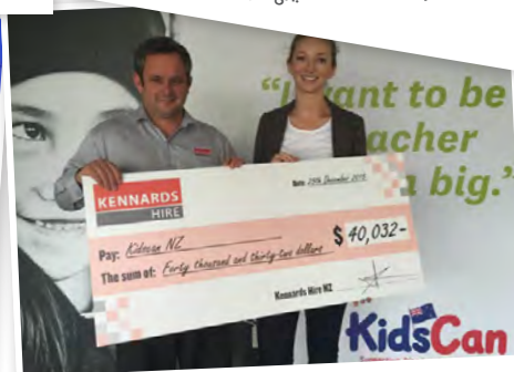
Our amazing friends at Kennards Hire raised over $40,000 for us through their 'Kennards for Kids' appeal. A huge effort.