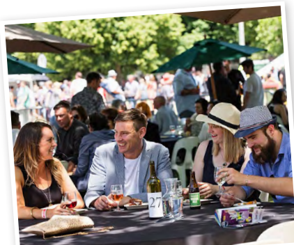
The South Island Wine and Food Festival & Smith Auctions raised a $13,805 via a charity auction for KidsCan. Incredible effort!

KidsCan is lucky to have so many fantastic businesses, schools and individuals who are passionate about our cause and fundraising for Kiwi kids! We love the creative and different ways of raising much needed funds for disadvantaged New Zealand children. Here are some of our most recent fundraisers. If you would like to fundraise for KidsCan and help support Kiwi kids in need, please visit kidscan.org.nz