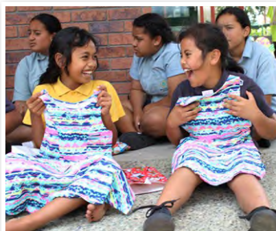
Thanks to Postie+ and their Postie+One campaign, 700 Christmas gifts were personally delivered to Finlayson Park School and the kids were thrilled!